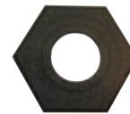
16 lb. base